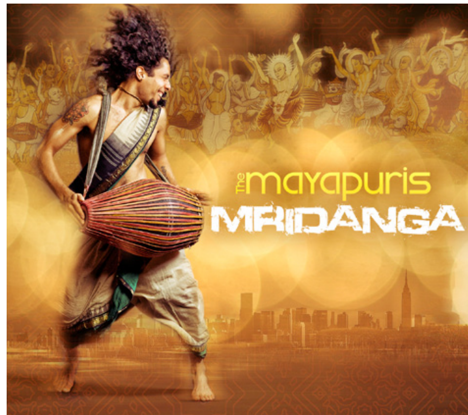
Mridanga, The Mayapuris debut CD released on Mantralogy.

They make you feel as if you can fly. My soul can't stop smiling when they start to do their thing.